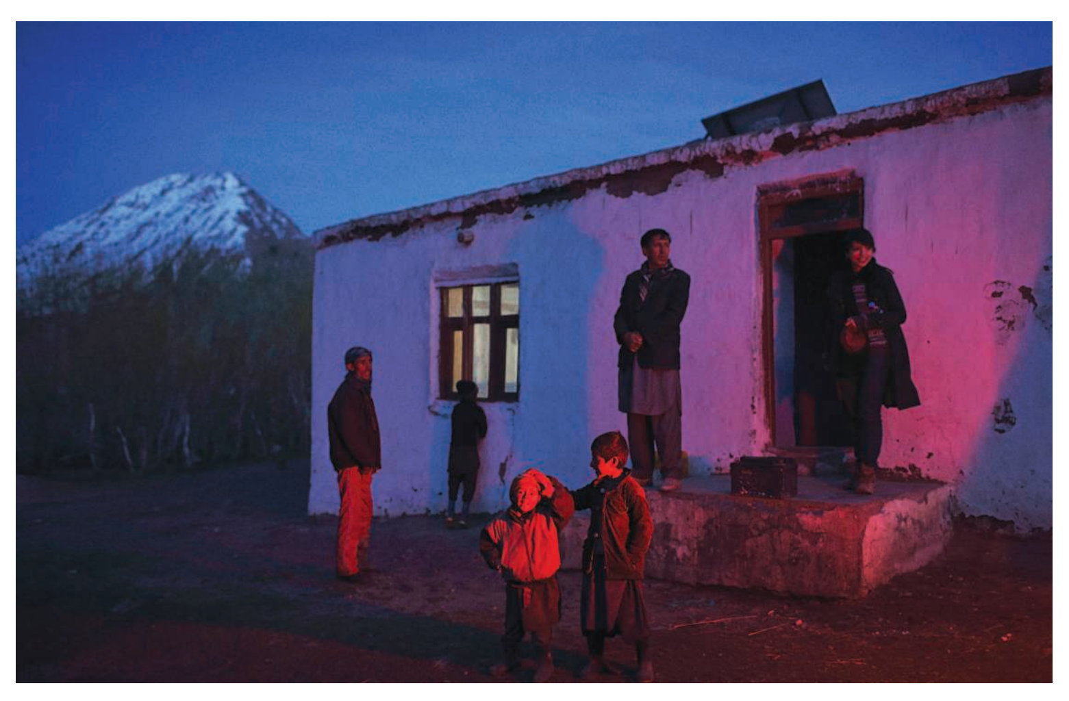
A family in Afghanistan's Wakhan region enjoys lighting at home for the first time. A new electric plant has reduced their costs of cooking and provides opportunities for home-based businesses and for students to study after dark. Electricity has energized small-scale industry and pumps for water access.